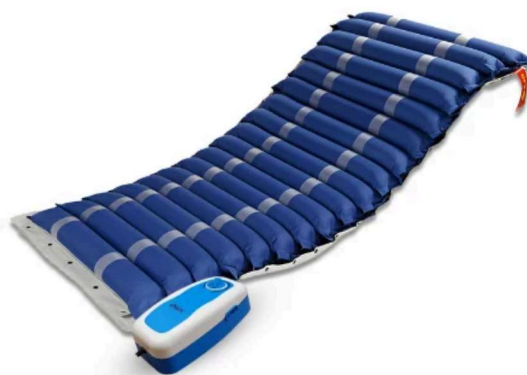
PATIENT CARE AIR MATTRESS & TUBE AIR MATTRESS FOR BED SORE PREVENTION