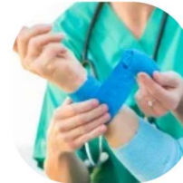
Critical Wound Dressing