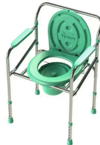
PATIENT CARE COMMUNE CHAIR TOILET SAFETY PRODUCTS

Why Angel Meditech Home Health Care Services