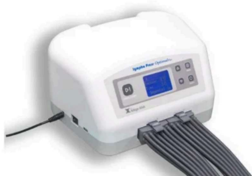
EFFECTIVE PREVENTION & MANAGEMENT OF DVT LYMPHA PRESS

Angel Meditech: Delivering Care Through Quality Equipment