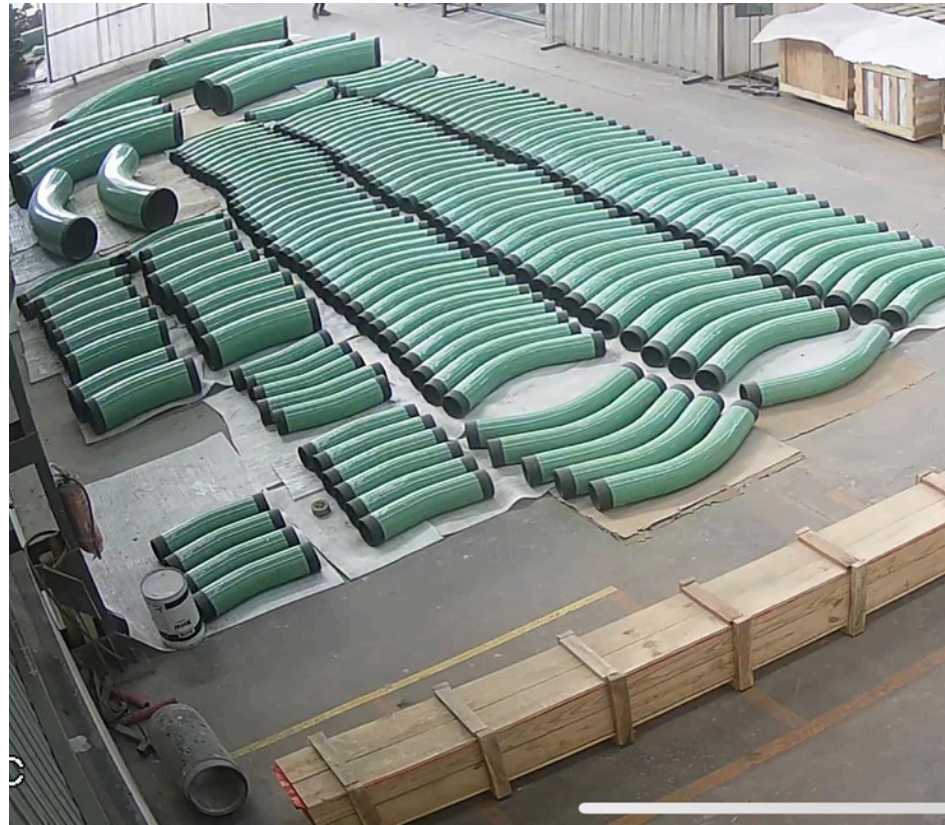
Dual Fbe Coating