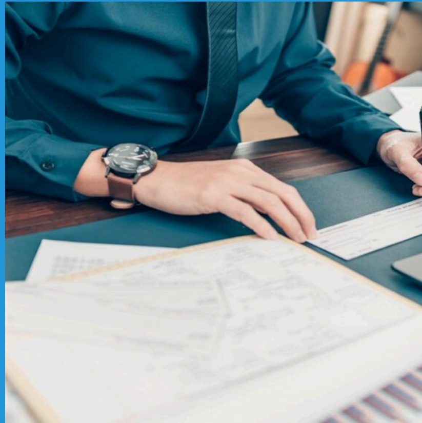
Demat of Physical Share Certificate