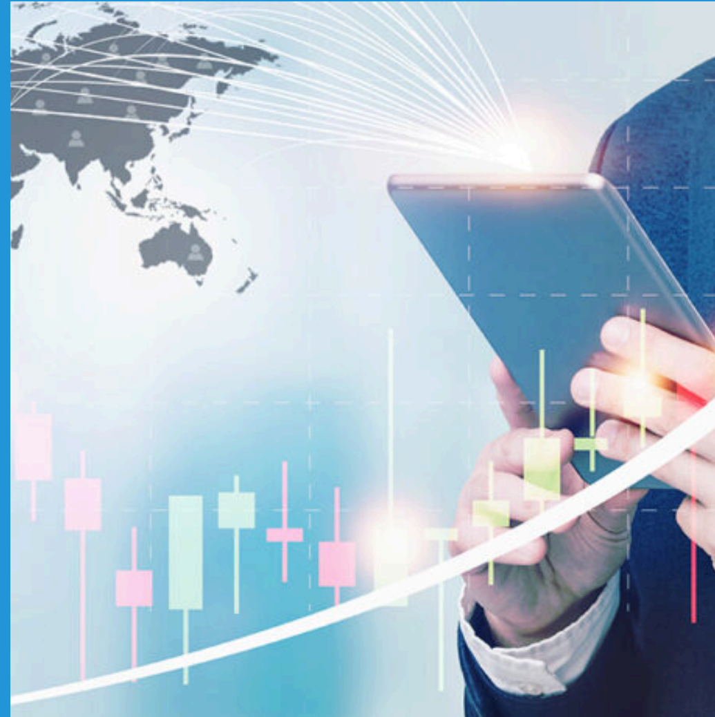
Convert Physical Shares to Demat