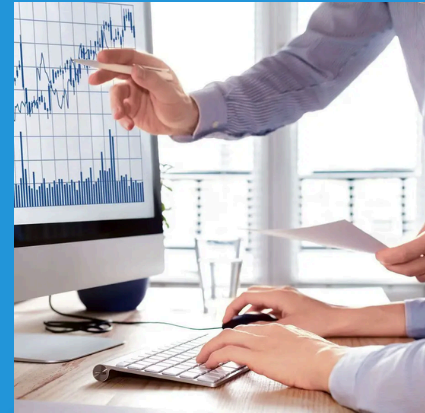
Dematerialization of Shares