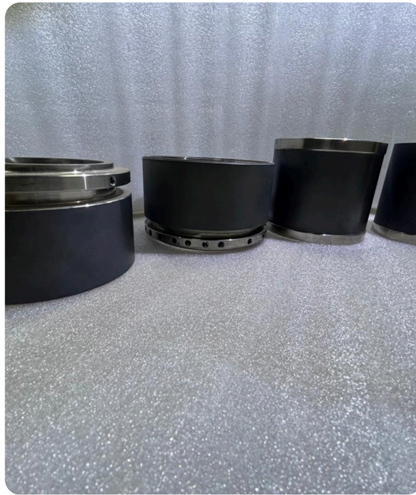
Mos2 Coating Service