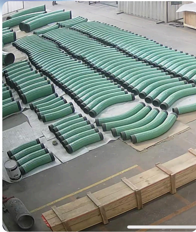
Coating Fbe Service