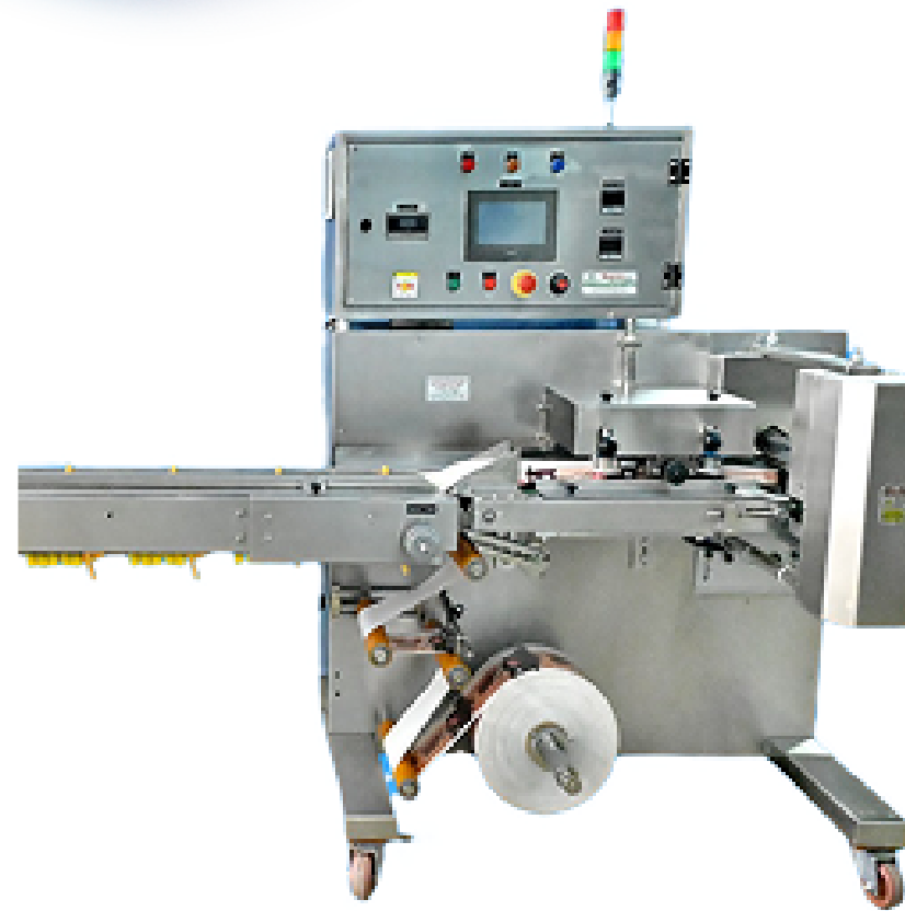
Switch Packing Machine