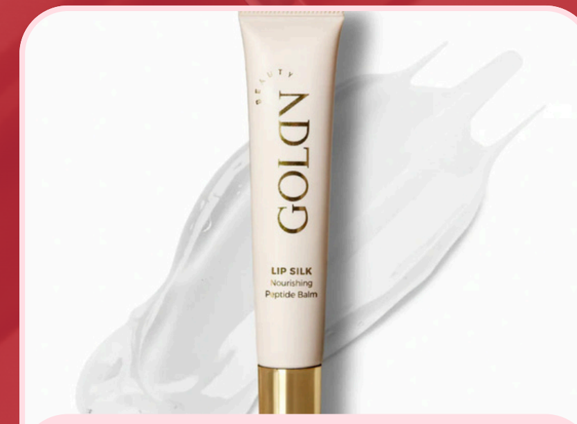
Lip Silk Bare