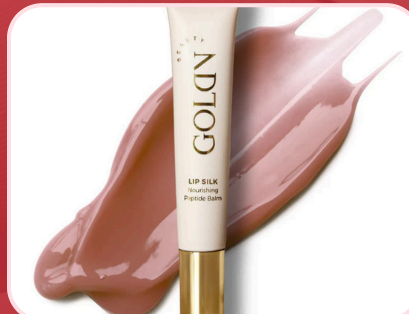
Lip Silk Minimal