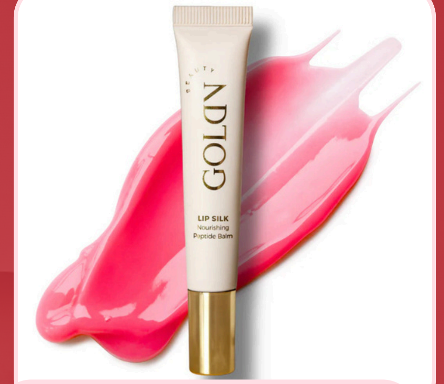
Lip Silk Poppy