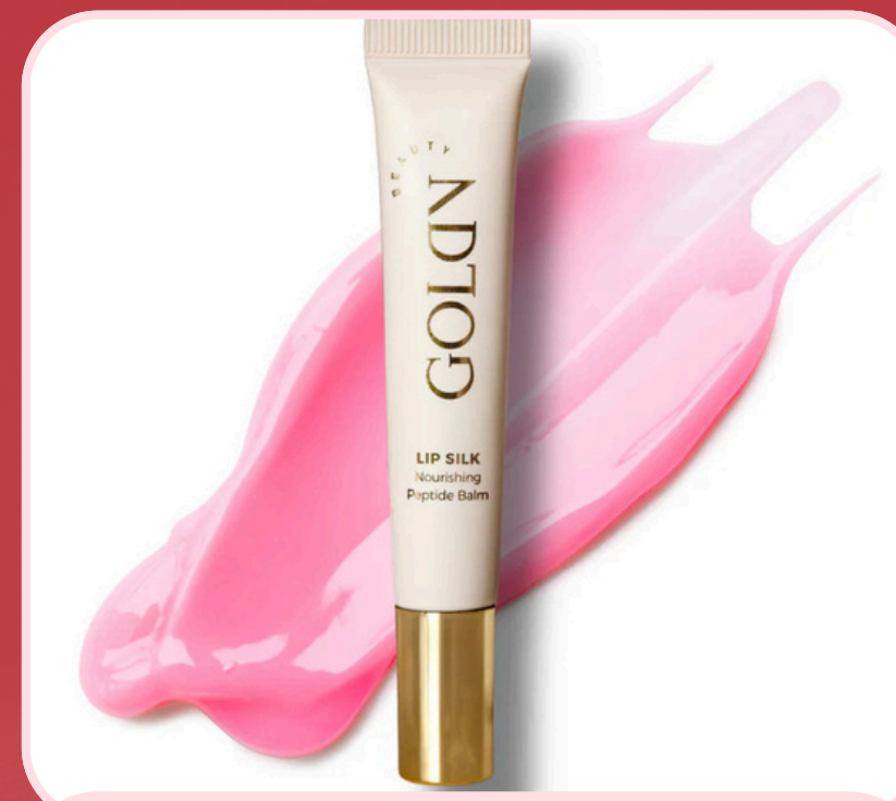
Lip Silk Flush

Our product range combines comfort, style, and functionality for everyday essentials and special occasions, enhancing your lifestyle effortlessly.